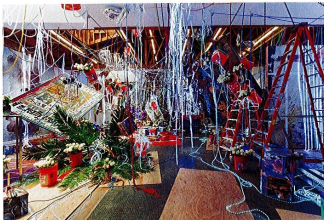
19 Parker Ito, A Lil' Taste of Cheeto in the Night , 2015 (installation view, Château Shatto, Los Angeles, 2015).

autumn with an immersive mirror and light installation inspired by the reflecting-maze fight scene in Bruce Lee's Enter the Dragon (1973). Instead of battling martial artists, the space will be animated by performances by musicians, dancers, sound artists and poets selected in association with London's Dalston-based independent music station NTS. Despite the setting's bellicose inspiration, the plan, apparently, is to encourage ad hoc collaboration between randomly programmed performers in the space. In the spirit of fruitful collaboration, perhaps it would be wise for the more typically fractious elements of London's music scene to bear in mind the great Lee's immortal words: 'The word "I" does not exist.' Hettie Judah